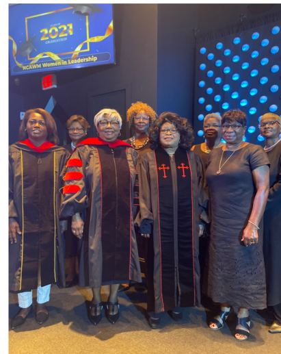
North Carolina Association for Women in Ministry, Inc., in Partnership with East Carolina Christian College and Seminary to offer Certificate Program in Women Leadership and Biblical Studies.